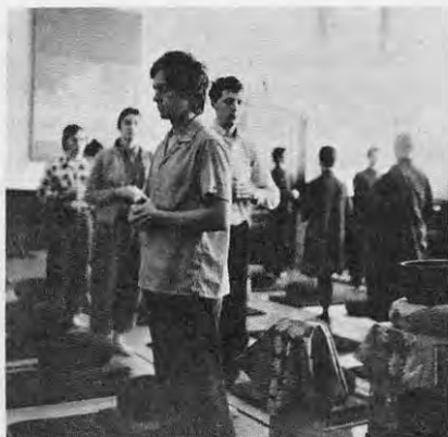
Kinhin, walking meditation, during a one-day sesshin at Zen Center, San Francisco.

Sambhogakāya Buddha is, figuratively speaking, like the sun; instead of observing things objectively, he understands his Buddha Nature in activity within himself. So, like the sun, although he is not trying to shine on everything objectively, to illuminate everything objectively, he is actually illuminating everything; he is actually helping others without trying to help. He can illuminate everything because he has, originally, that kind of power or potentiality. For Sambhogakāya Buddha the most important thing is to see, to attain enlightenment inwardly; his way is to illuminate himself, or to acquire enlightenment, instead of trying to illuminate the objective world.