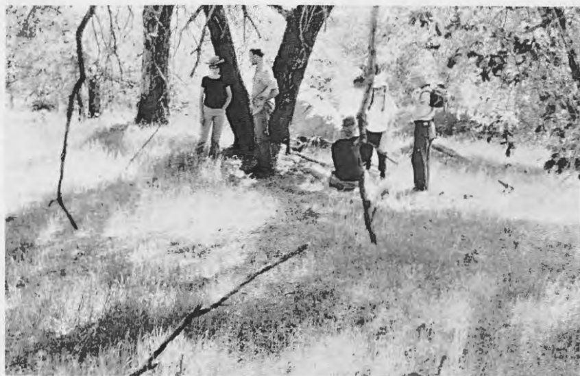
Students hiking near Zen Mountain Center.

As a super-human being Buddha was described in various ways. He had eighteen characteristics which were completely different from the usual person's, and he had eighteen virtues which were also different from the usual person's. And he had, physically, the thirty-two marks of a great man. They say this is just a description, just a big adjective for the Buddha. Maybe so, but there was some reason behind using such a big adjective for Buddha so that this kind of thing was described even in the Hīnayāna Sūtras. But actually Buddha was a human being and when he was eighty years old he passed away. At this point he was not a super-natural or super-human being. How should we understand his death in terms of his being super-human? If he was a super-human being there would not have been any need to take Nirvāna. When we say "to take Nirvāna" this means it was his choice to die or to remain alive. For other people it is not possible to have this kind of