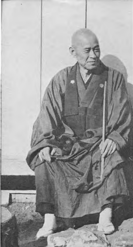
Suzuki Roshi at Zen Mountain Center