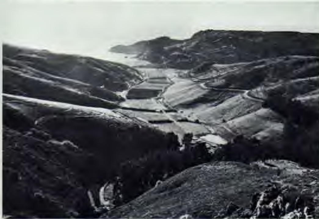
The Zen Farm Center in the Green Gulch Valley

There is a fairly large house, built on an old hay platform, that has five bedrooms; a big kitchen and a small kitchen; a library or office; and two large sitting rooms with fireplaces, one opening onto a deck above the garden and one opening onto the garden. Next to the big house there is an enclosed swimming pool and sauna. There is also a small bunkhouse; a double trailer with three bedrooms; and a ranch house with four bedrooms, a large studio, and a large sitting room. Probably the best for us is the oldest building, a huge barn with two ground level floors, the upper one the perfect size and proportions for a traditional Zendo.