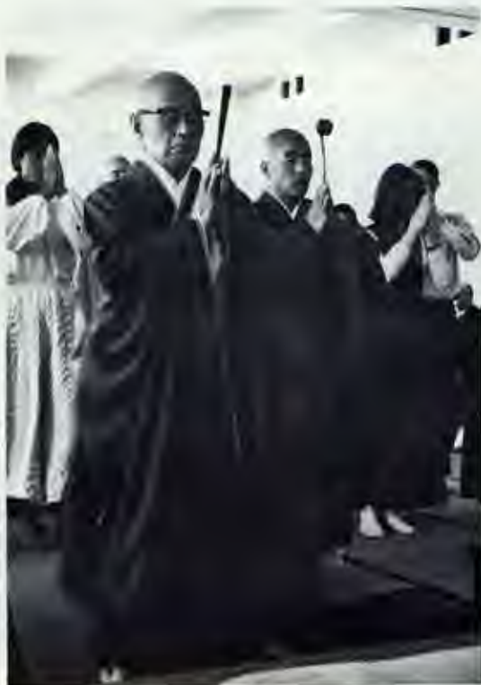
Lay Ordination, August 1971