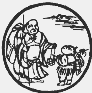
From the Ten Ox-herding Pictures, Nos. 1 and 10