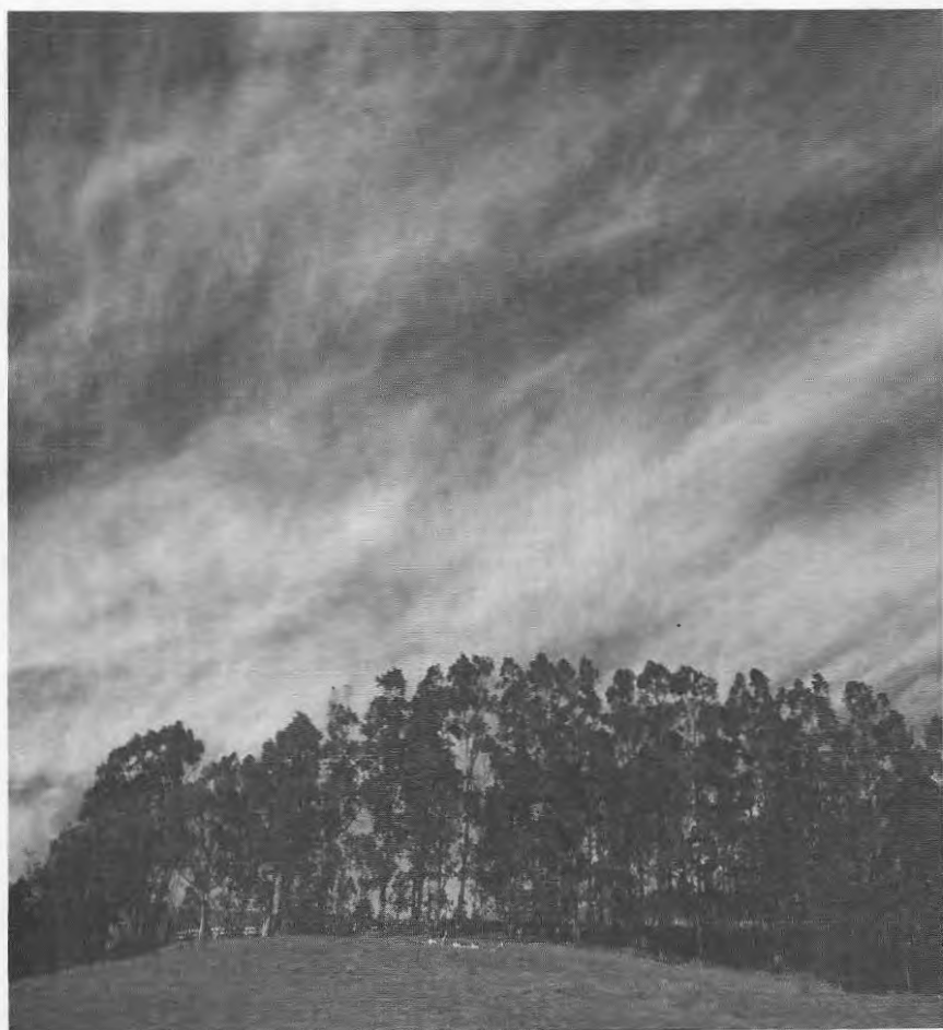
Clouds above Green Gulch Farm

This is Shakyamuni Buddha's ancient teaching on how to just be here. From here we can move forward to benefit all living beings.