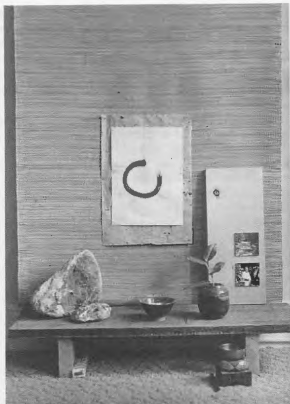
Personal altar in room at City Center