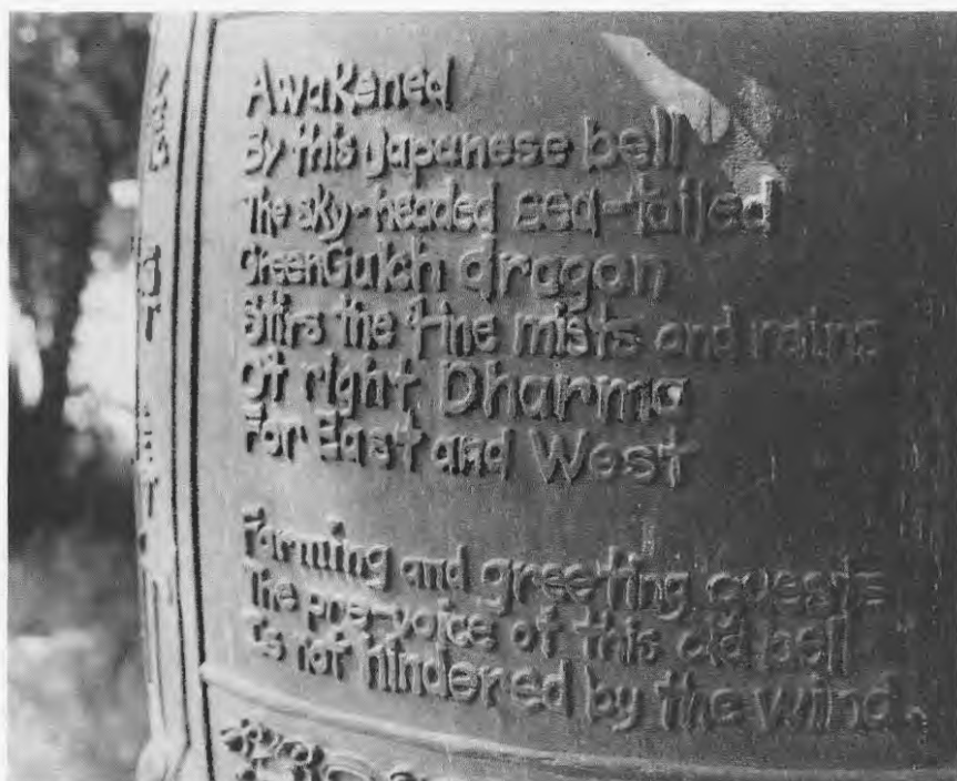
Boncho bell at Green Gulch Farm

This reminds me of Picasso who said something like, "If you run out of red, use blue. If you run out of blue, use red." So when we run out of acceptance, we use anything we have on hand for acceptance. And that becomes acceptance. At some point, we notice all this acceptance and then we actually take it up. It