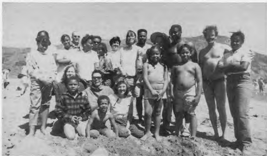
The Hayes Valley tutoring project held an outing at Green Gulch Farm in July.

The third one is called conception, samjna . Basically this is a process by which an image of an object of awareness is brought into contact with consciousness.