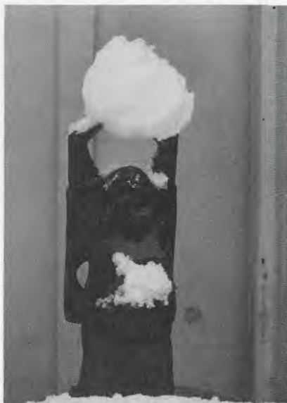
Hotel in Snow at Tassajara

Sometimes we sit in the middle of truly unbearable experience and we don't move. Sometimes we use whatever faculties arise, to transform our experience. We can hear through our pain. We can hear the cars on the road, or the song of the birds, not with our ears, but with our pain. Sometimes we hear the cries of the whole world through our pain. Avalokitesvara is covered with ears inside and out and can