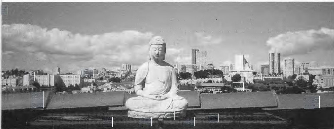
The City Center roof

Greens is a very dynamic environment—filled with light and fresh air. I always say it has a life of its own. I'd like to think Greens is on course for the next 100 years.