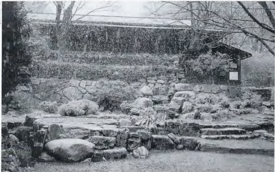
Falling snow and the Tassajara zendo

The first photograph I took was of blue sky. Not even a cloud. I was about three. Hadn't begun talking yet. That photo was my first empty frame, page, canvas, movie screen. The rest of my life has been spent filling and emptying those spaces. Behind it, inside it is the mandala of unconditional being. No duality resides there. It is empty and total. It is unexplored and all known, and for a short time, we wander its byways.