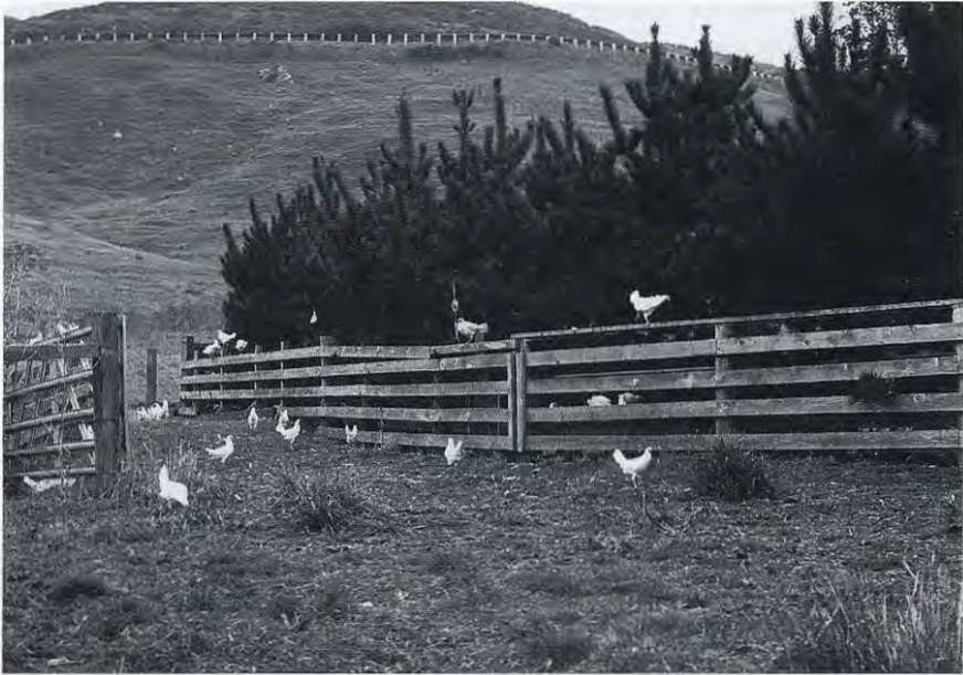
Chickens were raised at Green Gulch for a time.