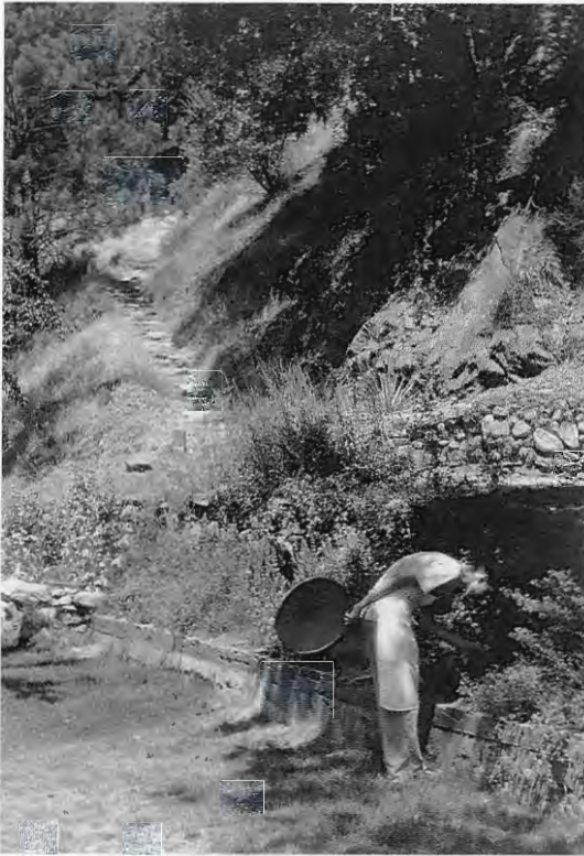
A cook collects herbs at Tassajara.

So I said, "Oh I'll rearrange my schedule," and I got the calendar and I looked at it and it was already full of commitments and I was still trying to add one more thing. Then I thought, "You're nuts! You're not forty anymore, you're seventy-six. This is not a way to live—this is just too much greed!" So that's been the suffering. I finally said, "I'm not going," and it was a great relief. I still would like to go, but, there you go. (Laughs) Anyhow, my suffering often is around greed. Around wanting to do it all, and part of this transiency thing is that I can't do as much as I could ten years ago, twenty years ago, thirty years ago. And I think I can, and it's crazy.