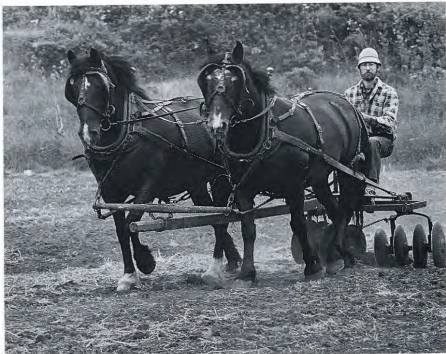
Steve Stucky, who was head of the fields at Green Gulch in 1975, drives a matched team of draft horses pulling a plow.