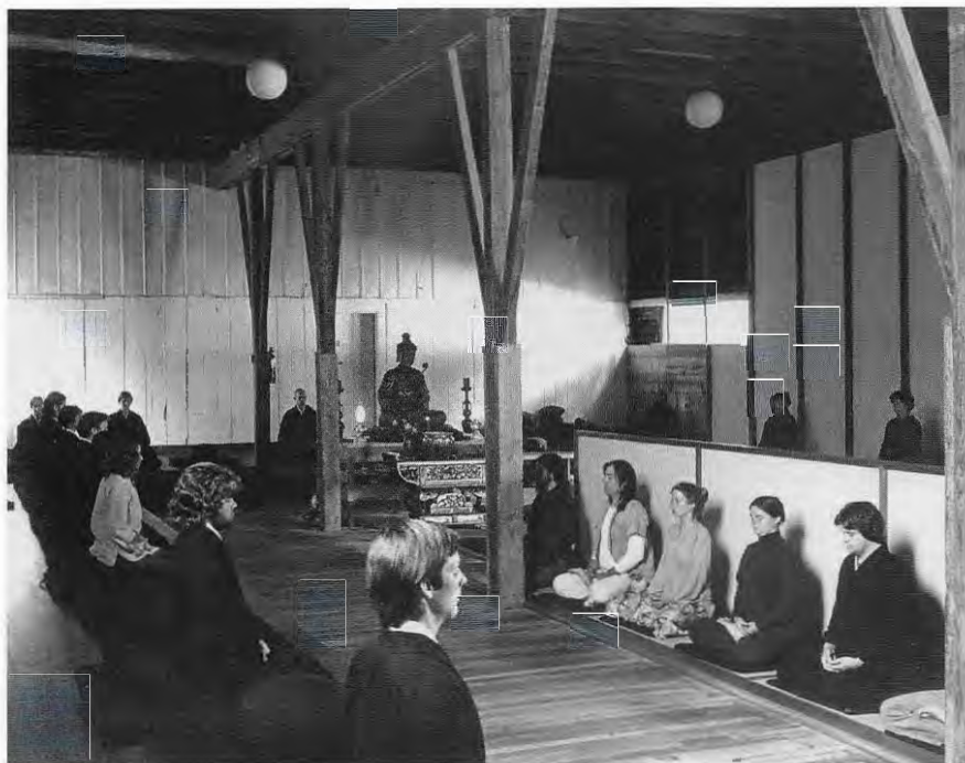
The zendo looked like this for many years, until the most recent structural upgrade was completed in 1992.