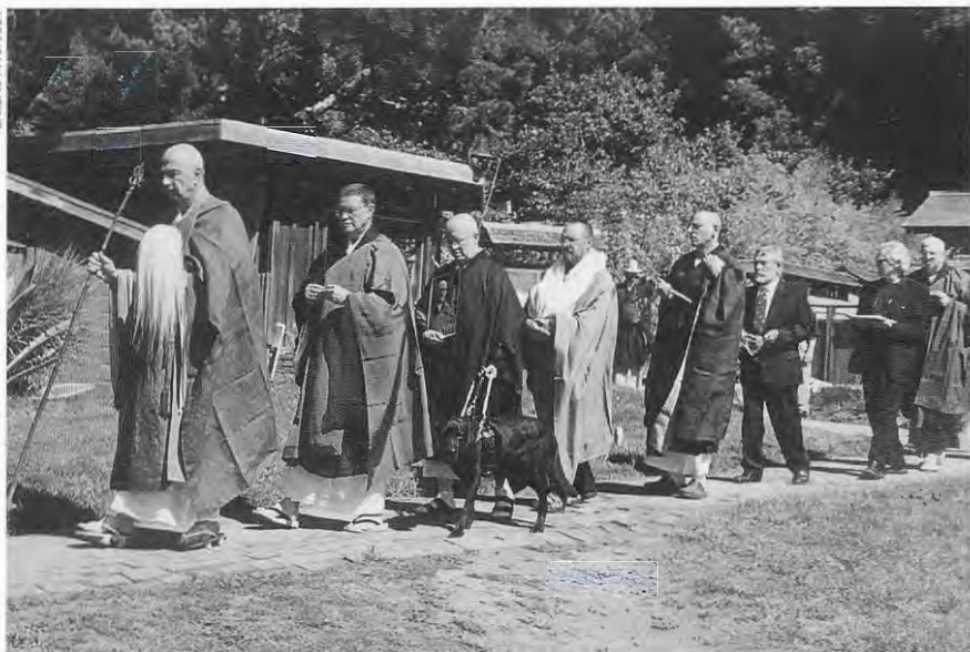
Funeral procession for Philip Whalen at Green Gulch Farm

So we assist you Philip, Zenshin Ryufu, a handful of fire, burning this phantom body. Rujing, Dogen Zenji's teacher said: