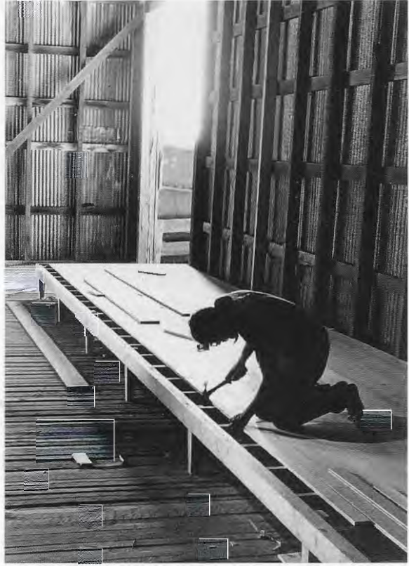
Building tans for zazen in the barn zendo